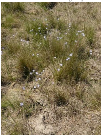
Linum marginale Image by Martin Butterfield