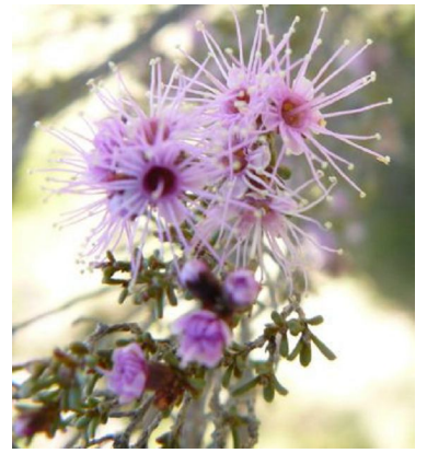
Kunzea parvifolia