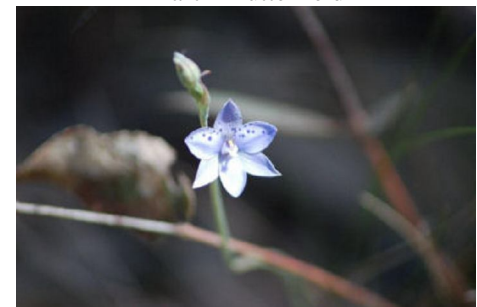
Thelymitra juncifolia