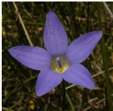
Wahlenbergia sp. Image by Martin Butterfield