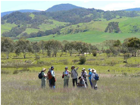
Bunhybee grassland

'Bunhybee' is 35km south of Braidwood, in southern N.S.W. It is a 49 hectare conservation property, mainly grassland with some Eucalyptus pauciflora woodland. 98% of the property is subject to a Conservation Agreement. This is effectively a permanent covenant, inscribed on the title; which means that the present and all future owners must conserve it in compliance with that Agreement. The remaining 1 hectare is available for a dwelling. The owners of the property have an informative website - http://rogerclarke.com.au/Bunhybee/ We visited the property during peak flowering of many of the grassland plants – it was difficult to walk without damaging flowers. There were mass displays of Leptorhynchus squamatus , Chrysocephalum apiculatum , Pultenaea subspicata , Gompholobium minus , Laxmannia gracilis , many different grasses and lots of smaller displays - Convolvulus angustissimus , Leptospermum lanigerum , Hakea microcarpa , Polygala japonica , Brachyscome rigidula , Calotis glandulosa , C. scabiosifolia var. integrifolia , Ranunculus lappaceus , Craspedia variabilis , Stylidium graminifolium , Utricularia dichotoma and many other things too numerous to mention. A good variety of orchids - Diuris chryseopsis , D. monticola , Diuris sulphurea , Hymenochilus bicolor , Microtis unifolia , Thelymitra juncifolia , T. pauciflora and Stegostyla moschata .