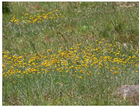
Chrysocephalum apiculatum