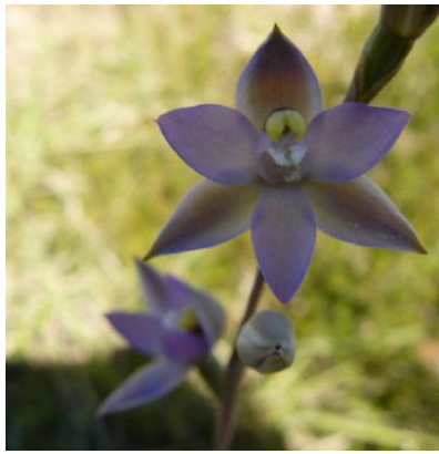
Thelymitra pauciflora