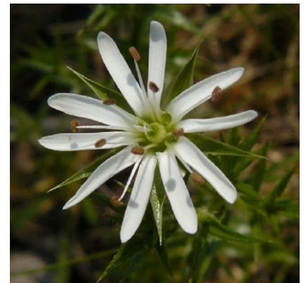
Stellaria pungens