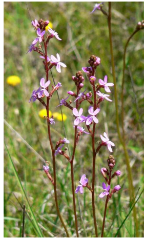
Stylidium graminifolium