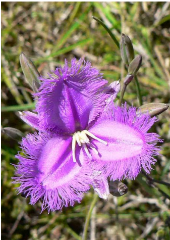
Thysanotus tuberosus Image by Jean Geue