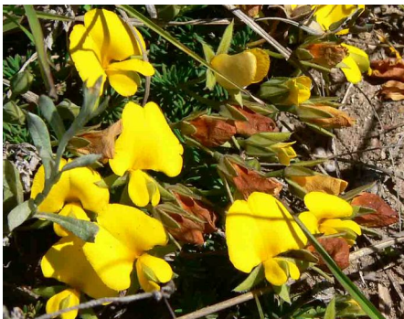
Gompholobium minus