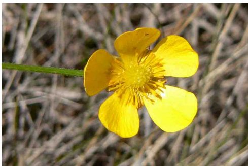
Ranunculus lappaceus