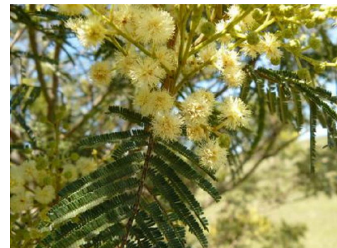
Acacia mearnsii