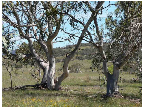
Eucalyptus pauciflora