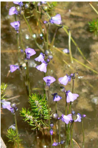
Utricularia dichotoma