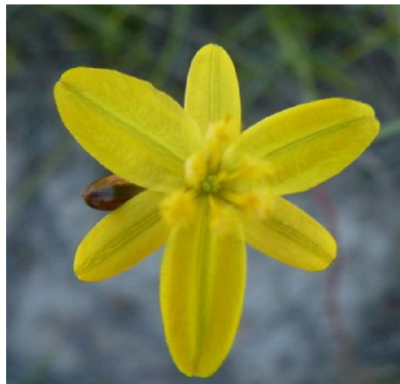
Tricoryne elatior