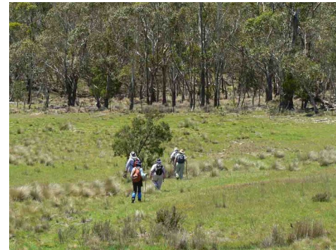
Bunhybee grassland – boundary at tree line