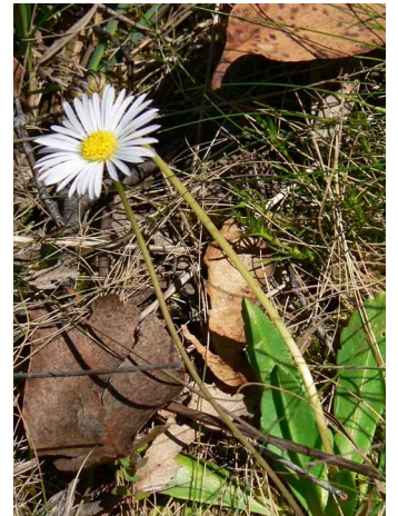
Brachyscome decipiens