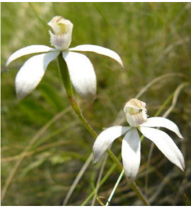
Stegostyla moschata