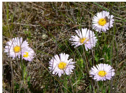
Calotis glandulosa